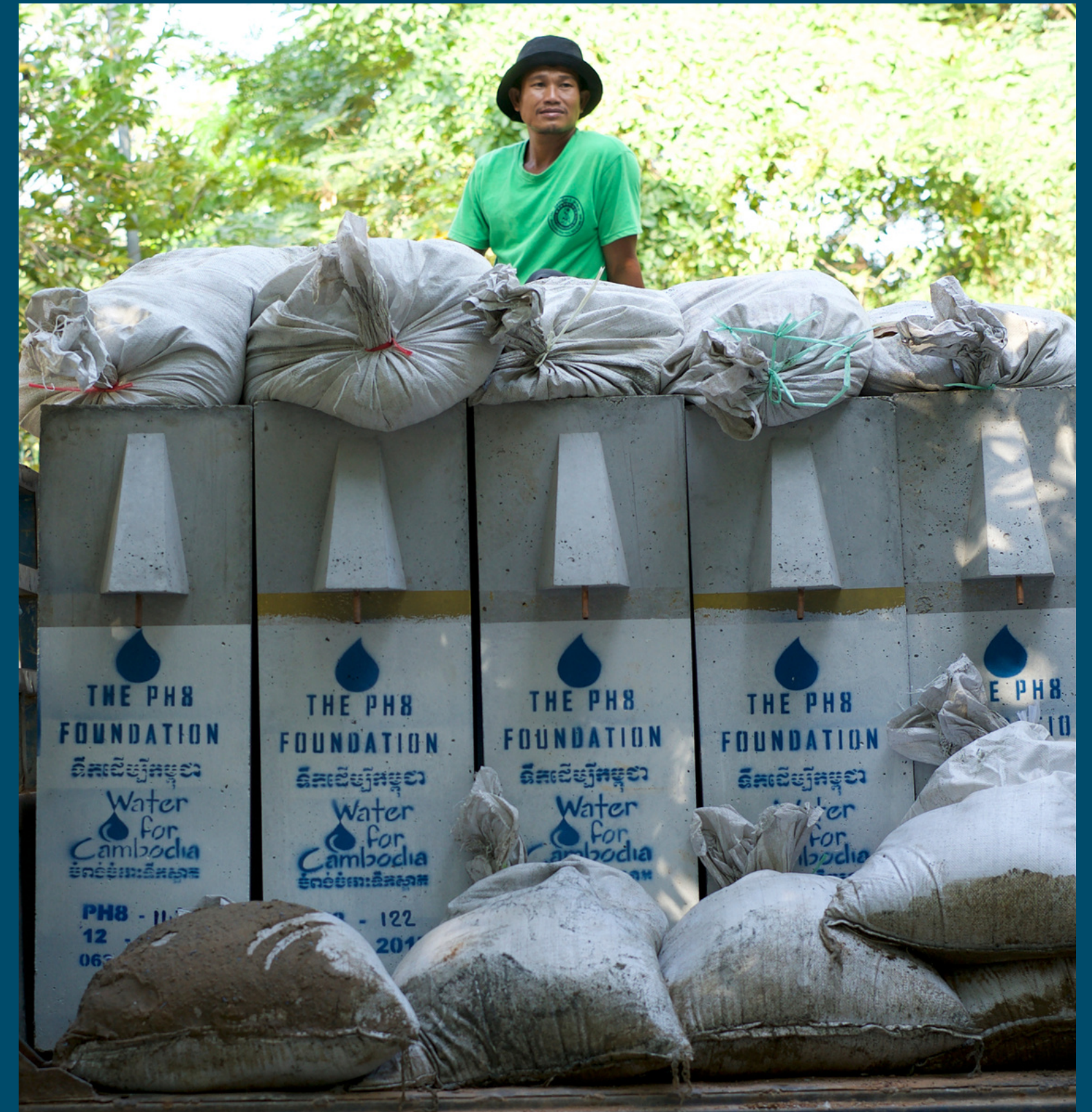
BioSand Filters ready for delivery